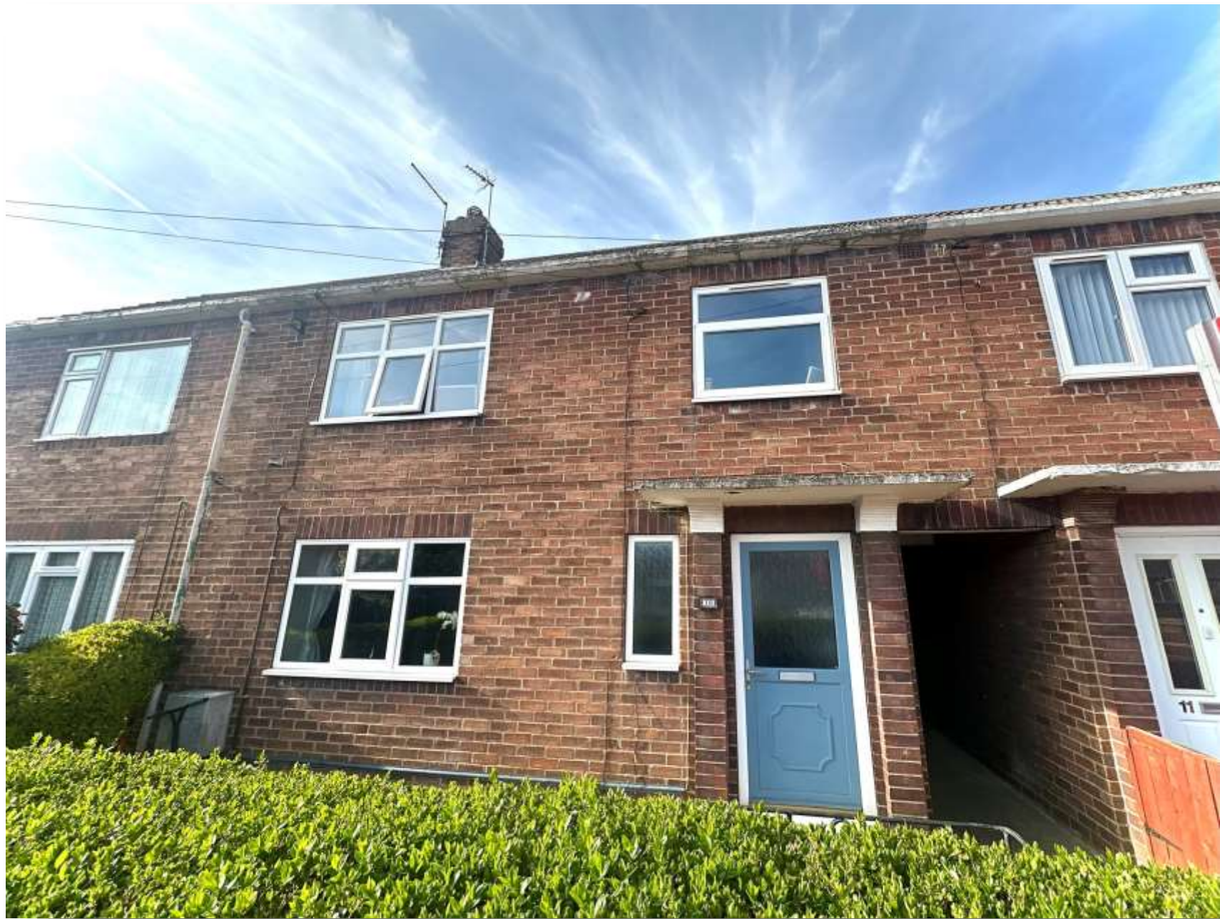
Lambwath Villas, Skirlaugh, Hull, HU11 5DS