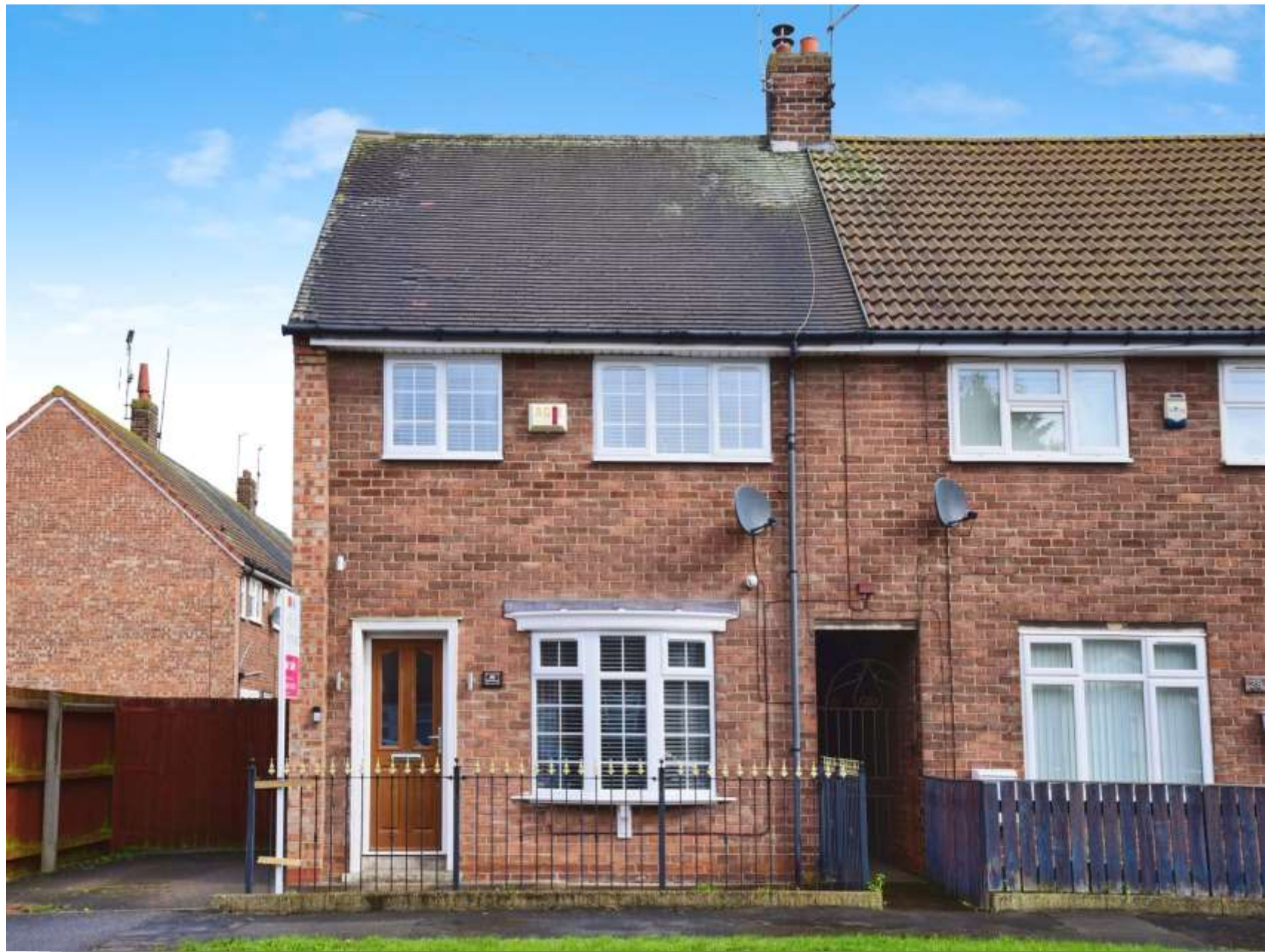
Bothwell Grove, Hull, HU9 5JY