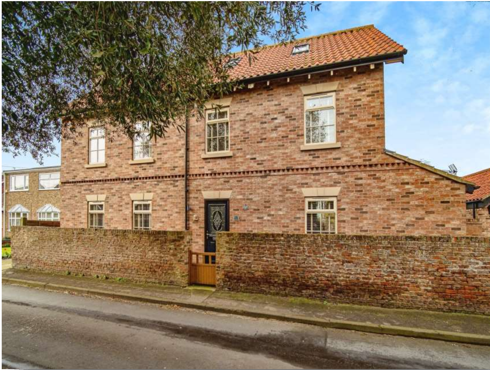
Rectory Lane, Preston, Hull, HU12 8UE