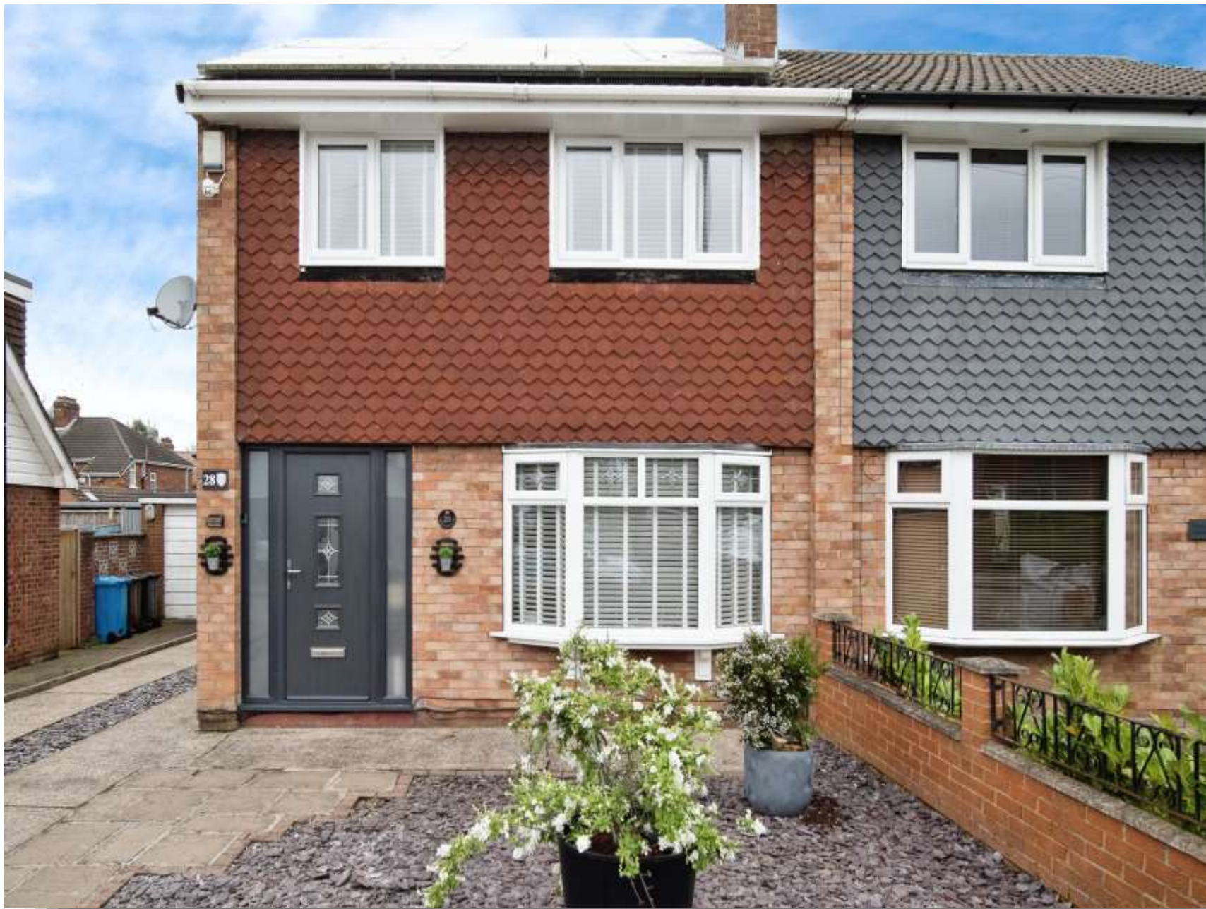
Highfield Close, Sutton-On-Hull, Hull, HU7 4UA