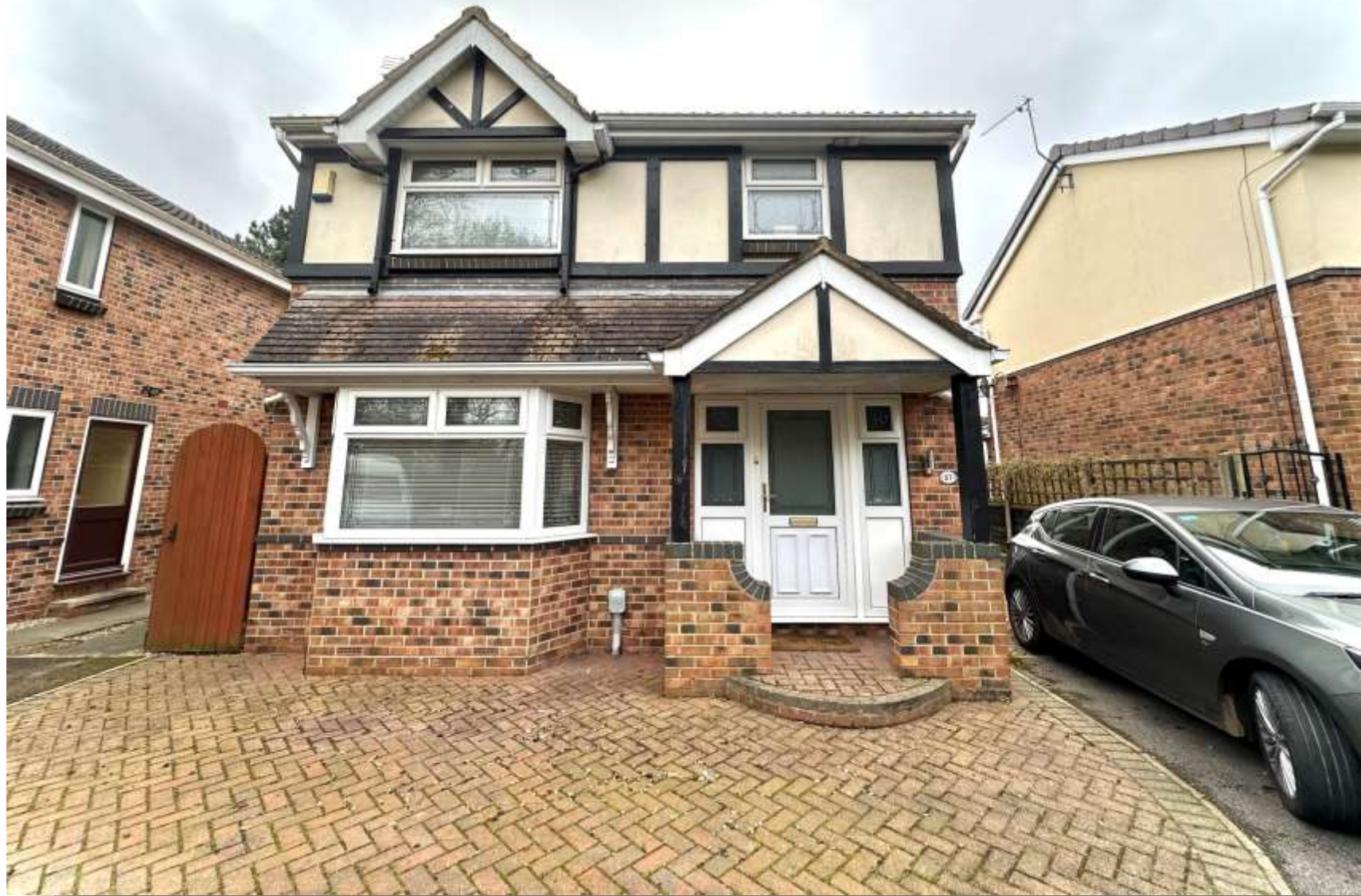
St. Peters View, Bilton, Hull, HU11 4AE