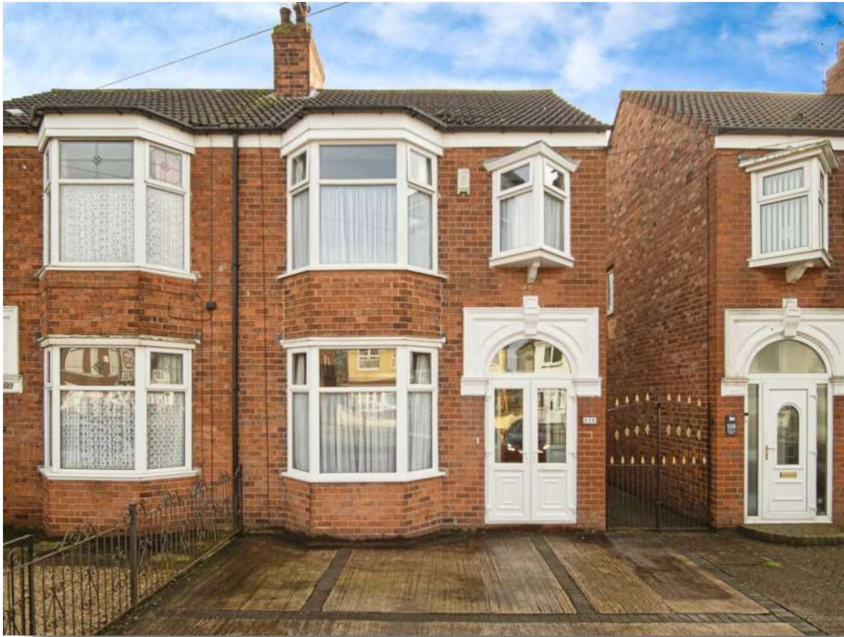
James Reckitt Avenue, Hull, HU8 0LG