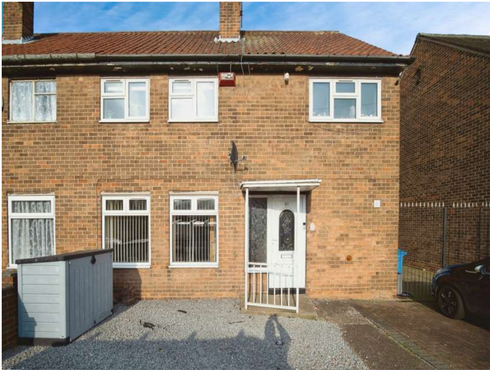
Nornabell Street, Hull, HU8 7SJ