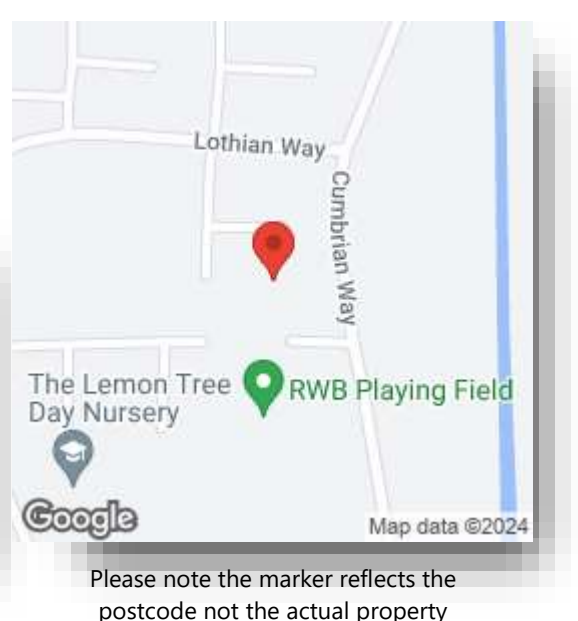
view this property online williamhbrown.co.uk/Property/HDR121702