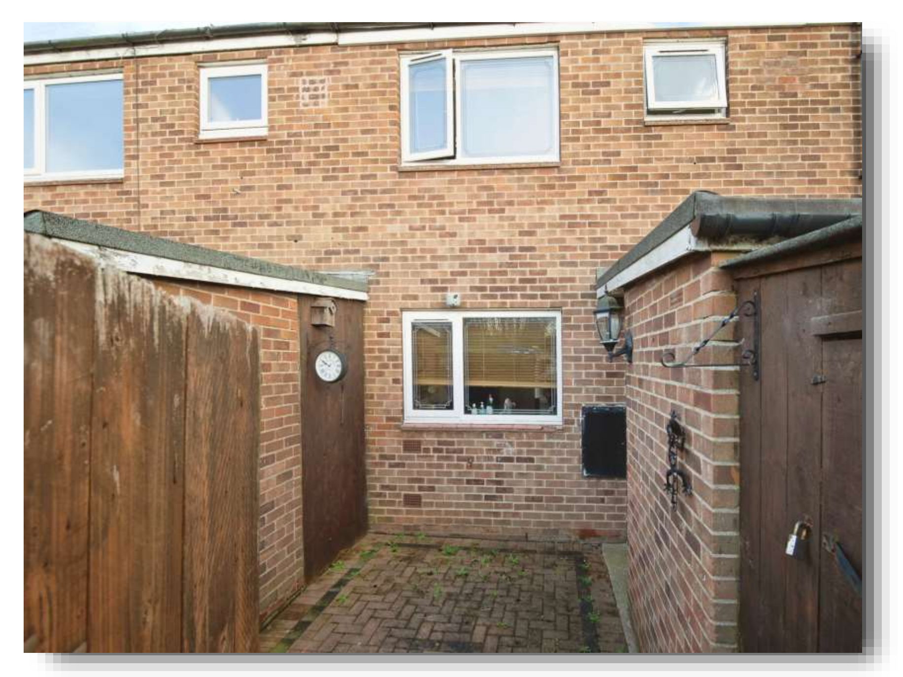
Leitholm Close, Bransholme, Hull, HU7 5BL