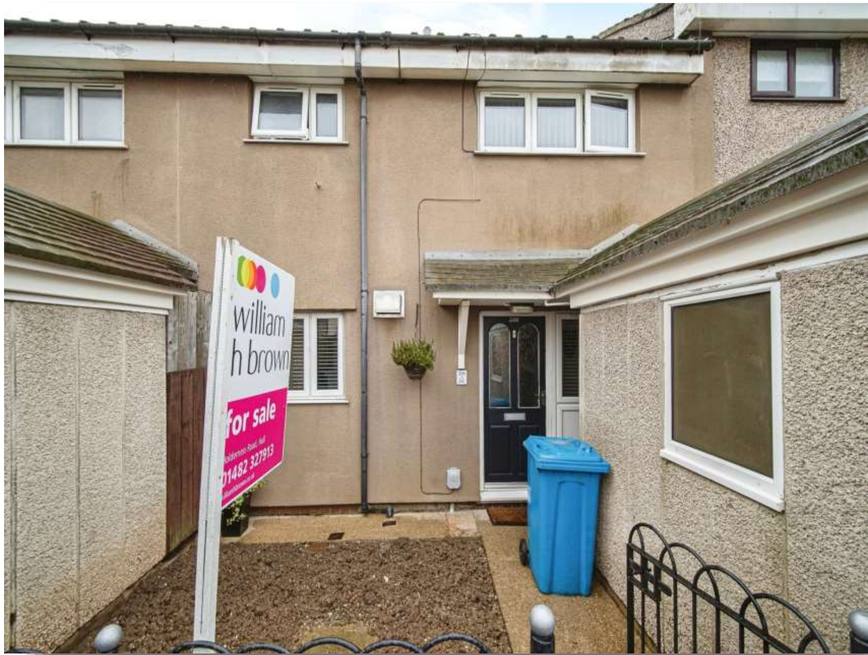
Biggin Avenue, Bransholme, Hull, HU7 4NS