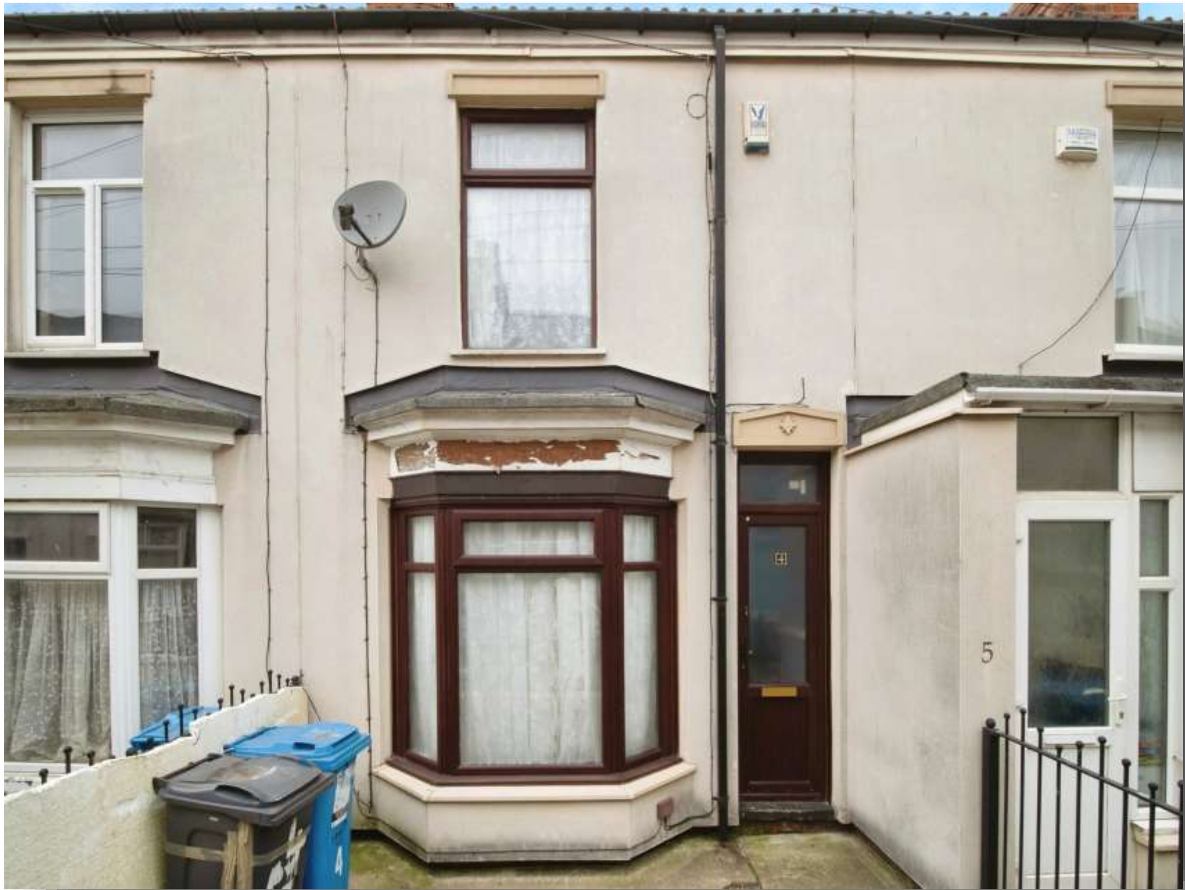
Ernest Avenue, Hull, HU9 2JP