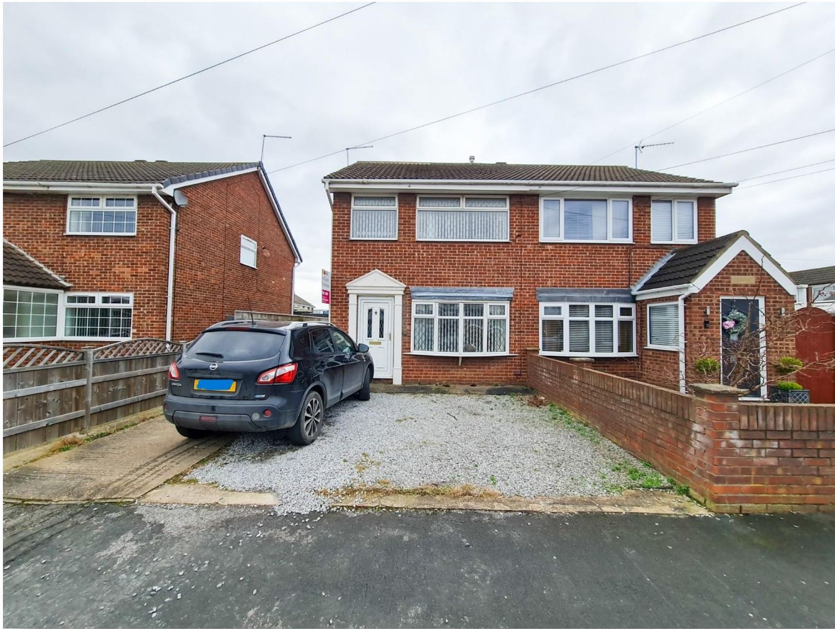
Willowdale, Hull, HU7 6DW