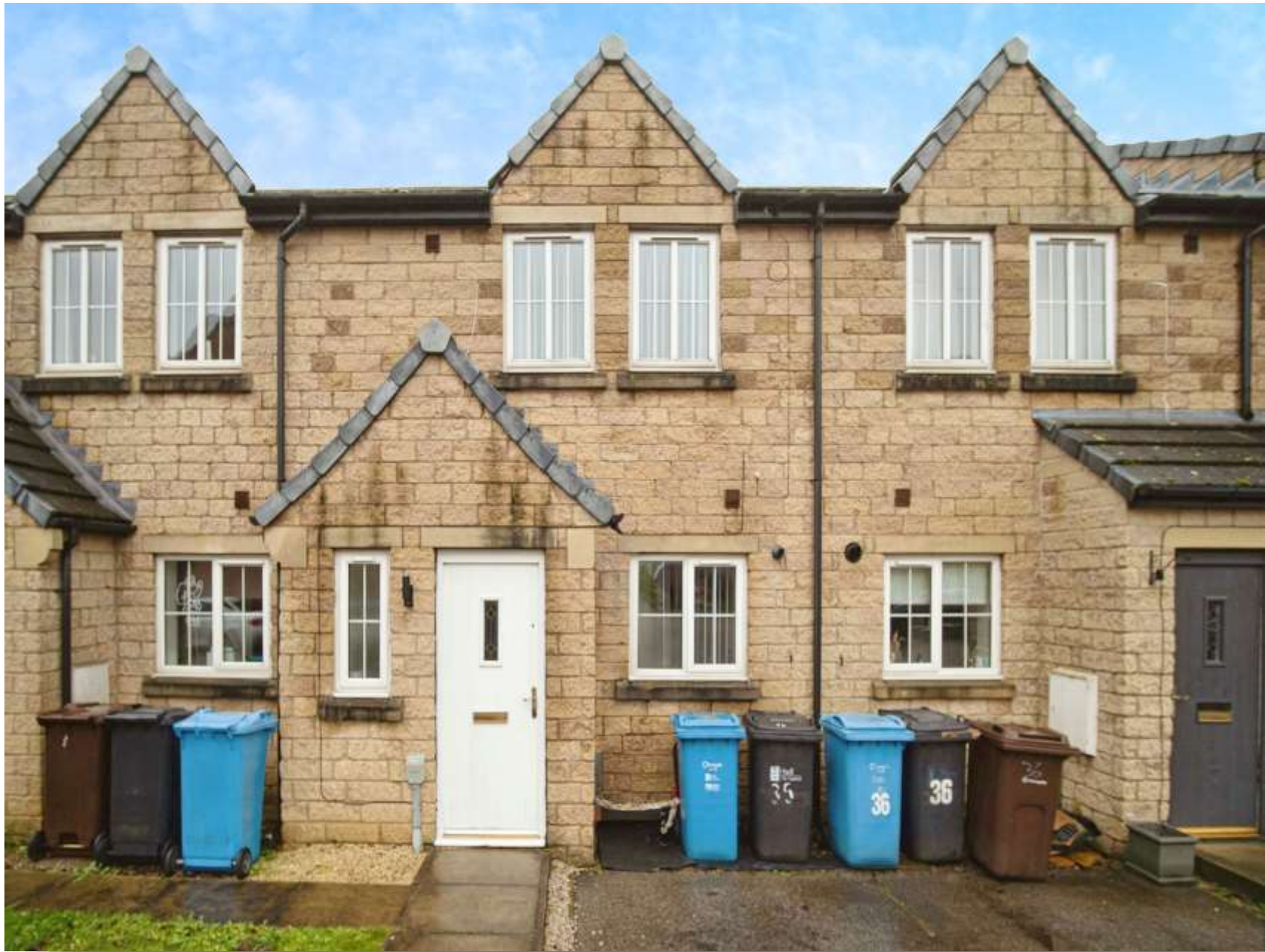
Lambwath Hall Court, Bransholme, Hull, HU7 4WN