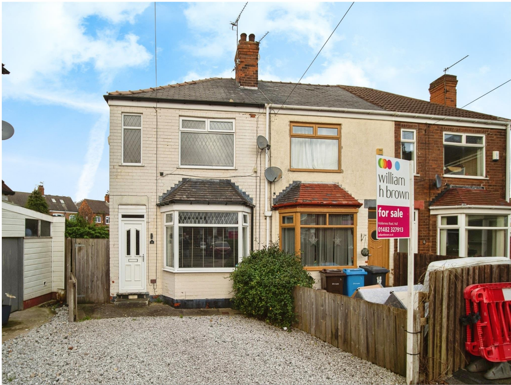
Alston Avenue, Hull, HU8 8UA