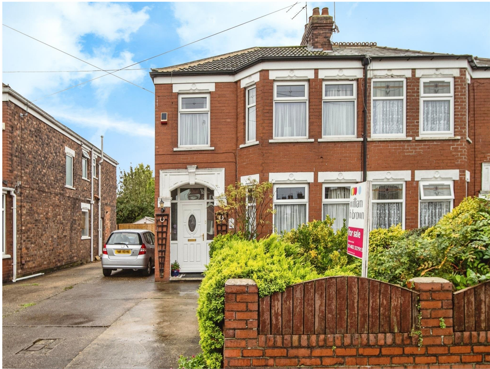
Maybury Road, Hull, HU9 3NX