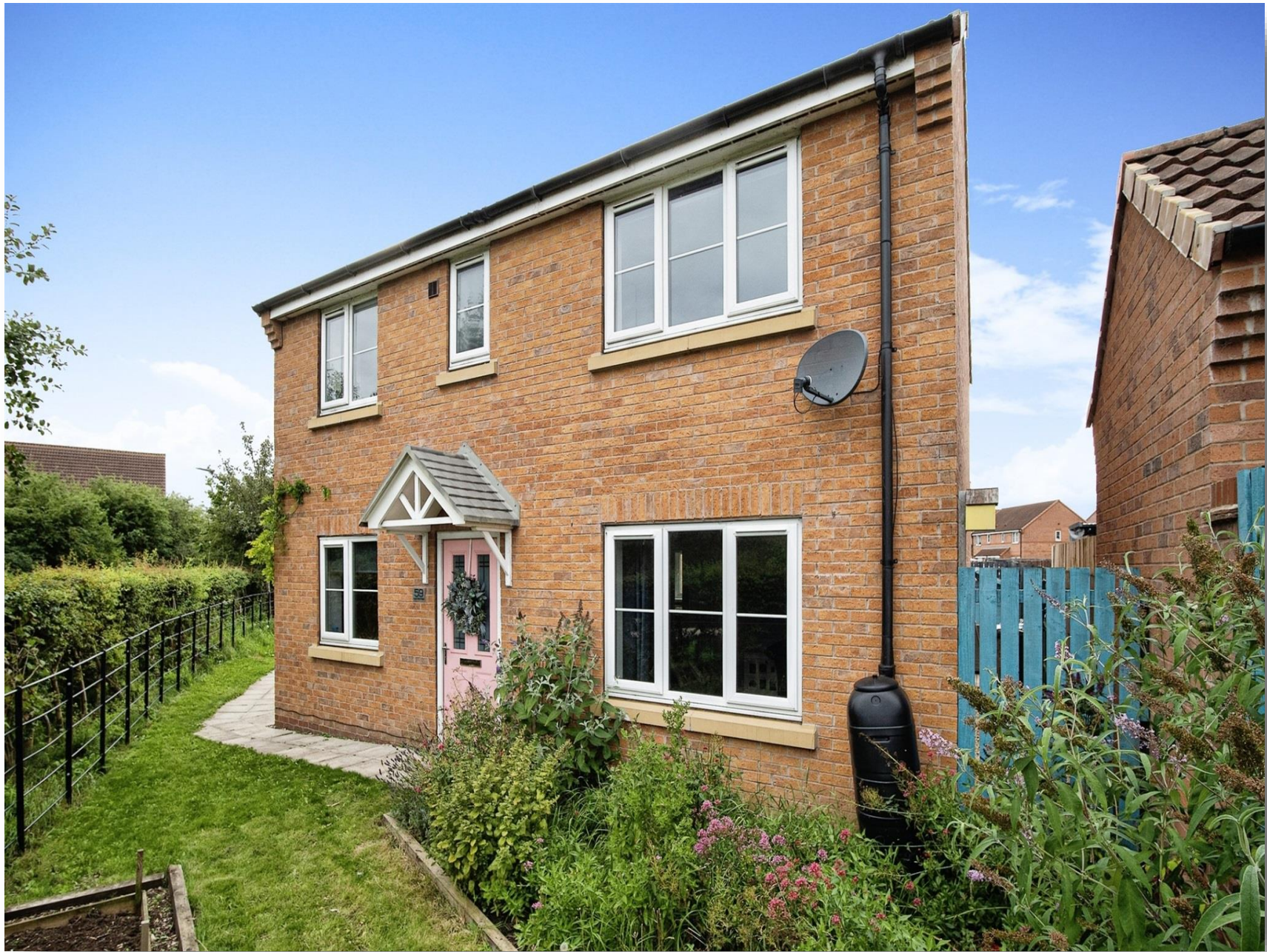
Hyde Park Road, Kingswood, Hull, HU7 3AS