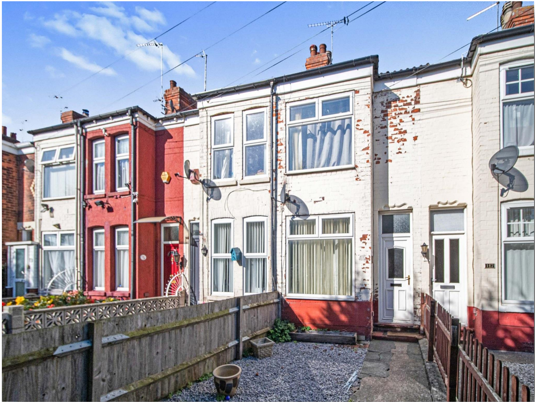
Egypt Street, Hull, HU9 5QZ