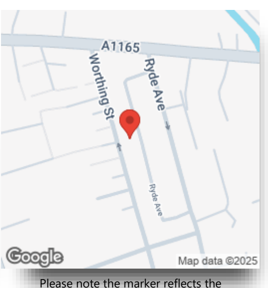
view this property online williamhbrown.co.uk/Property/NEA119599