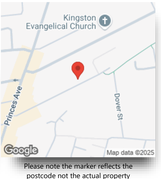
view this property online williamhbrown.co.uk/Property/NEA119352