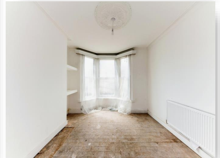
Plane Street, Hull HU3 6BY