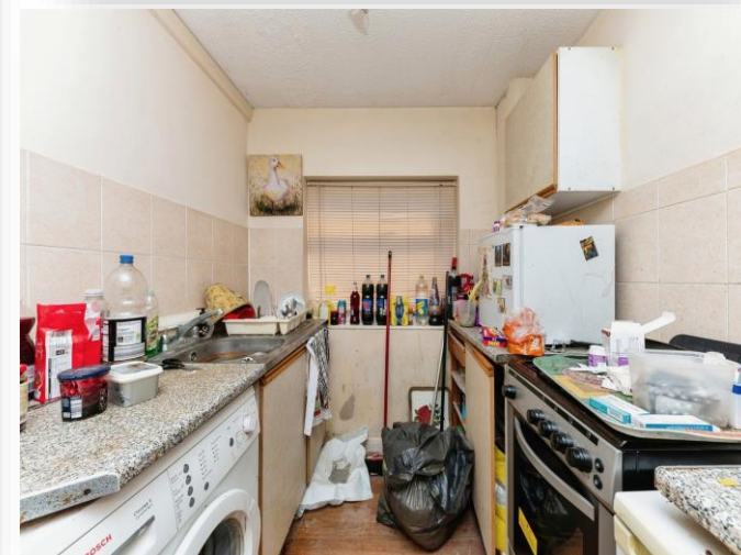
St. Johns Court Queens Road,Hull HU5 2QG