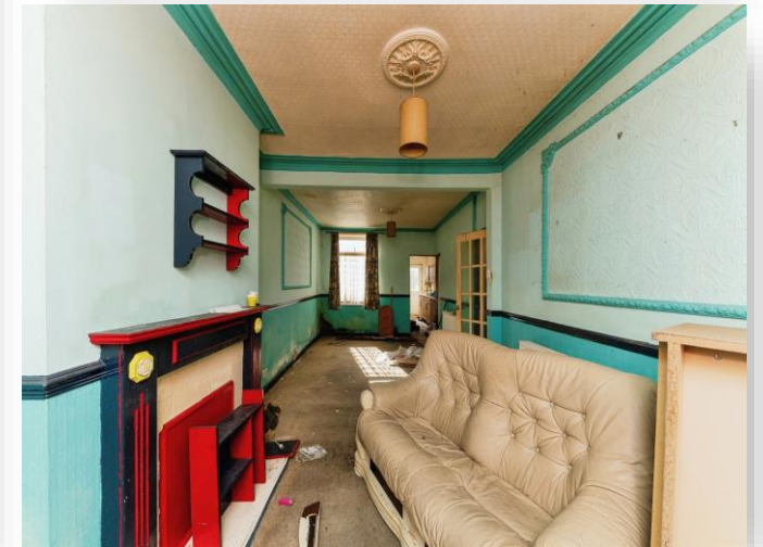
Tunis Street, Hull HU5 1EZ