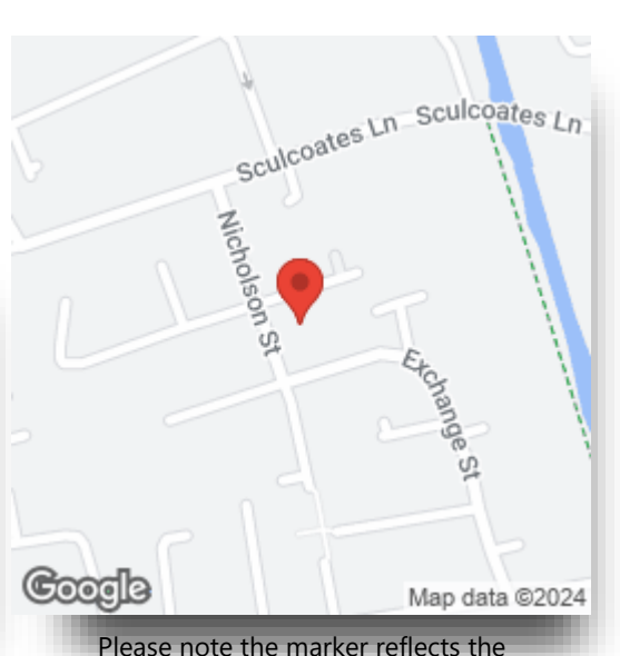
view this property online williamhbrown.co.uk/Property/NEA119019