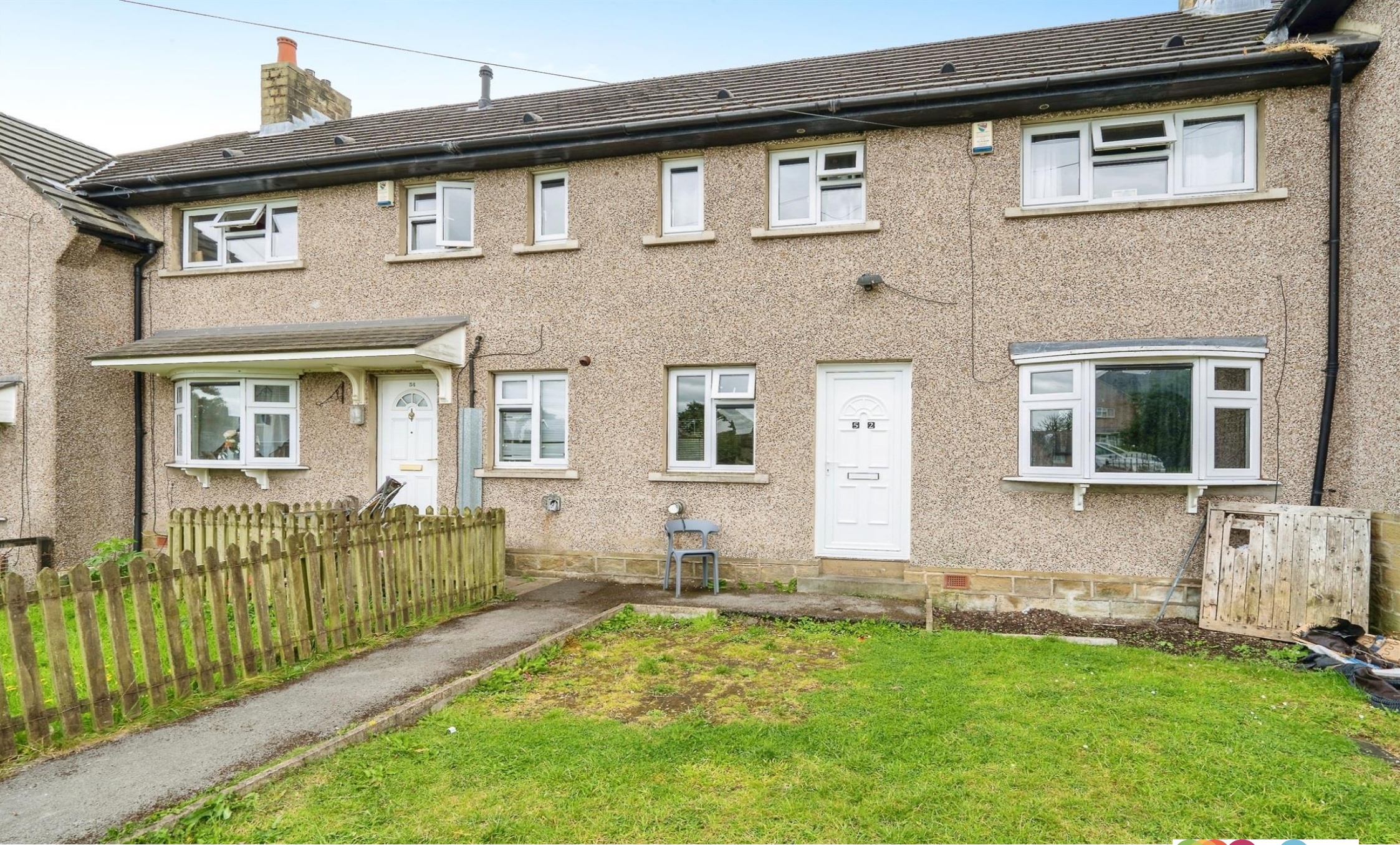
Gilbert Grove, Huddersfield HD4 5EU