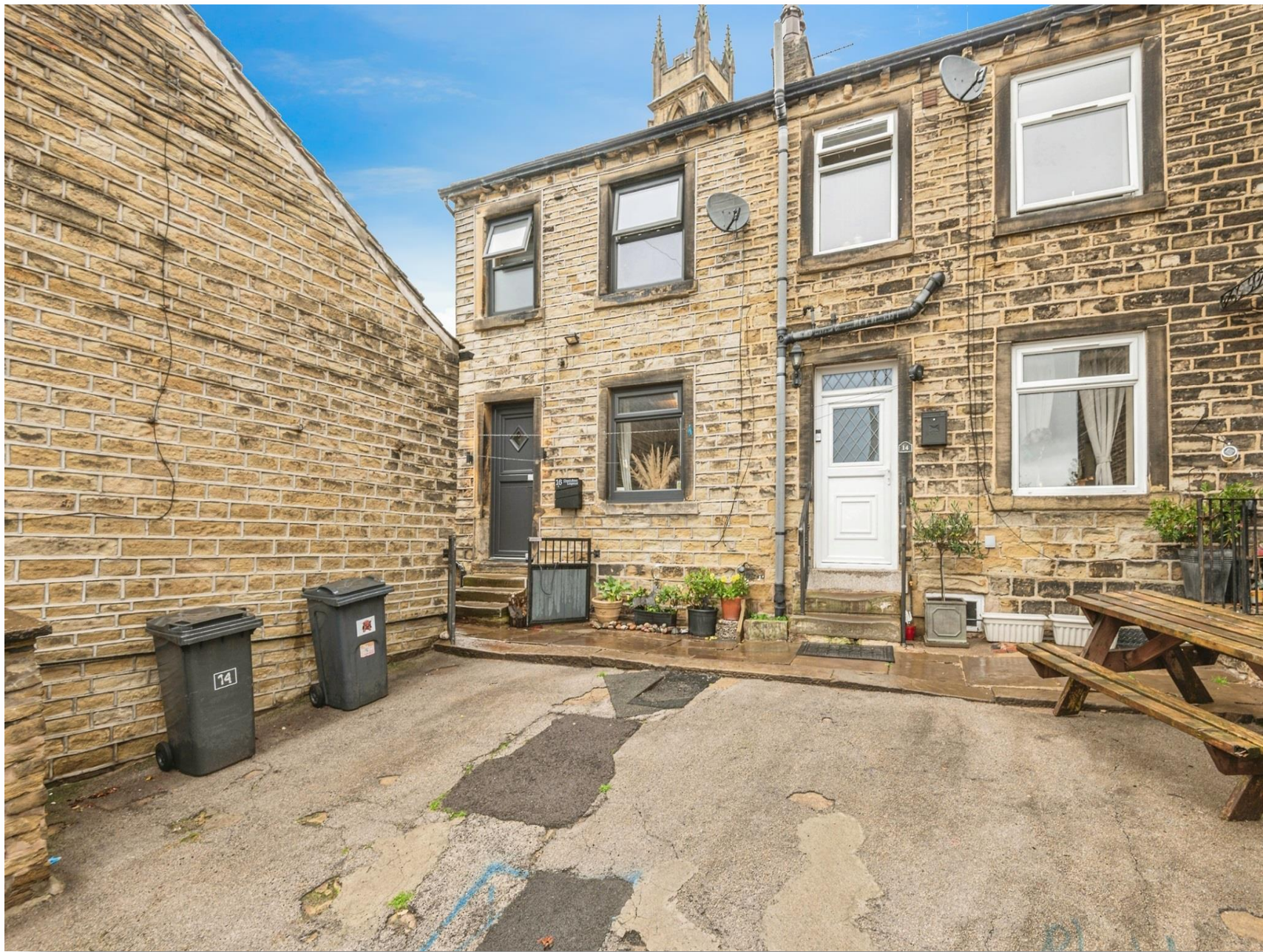
Church Street, Longwood, HUDDERSFIELD HD3 4SY