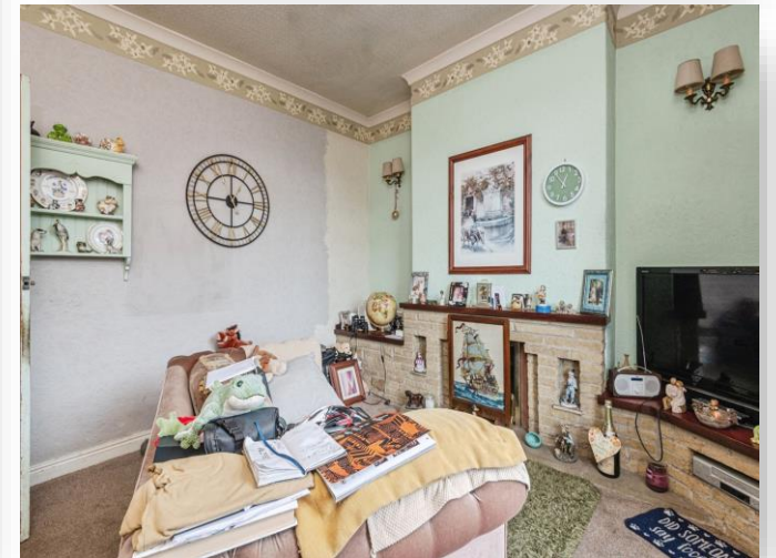
Hazel Grove, Linthwaite, Huddersfield, HD7 5TQ