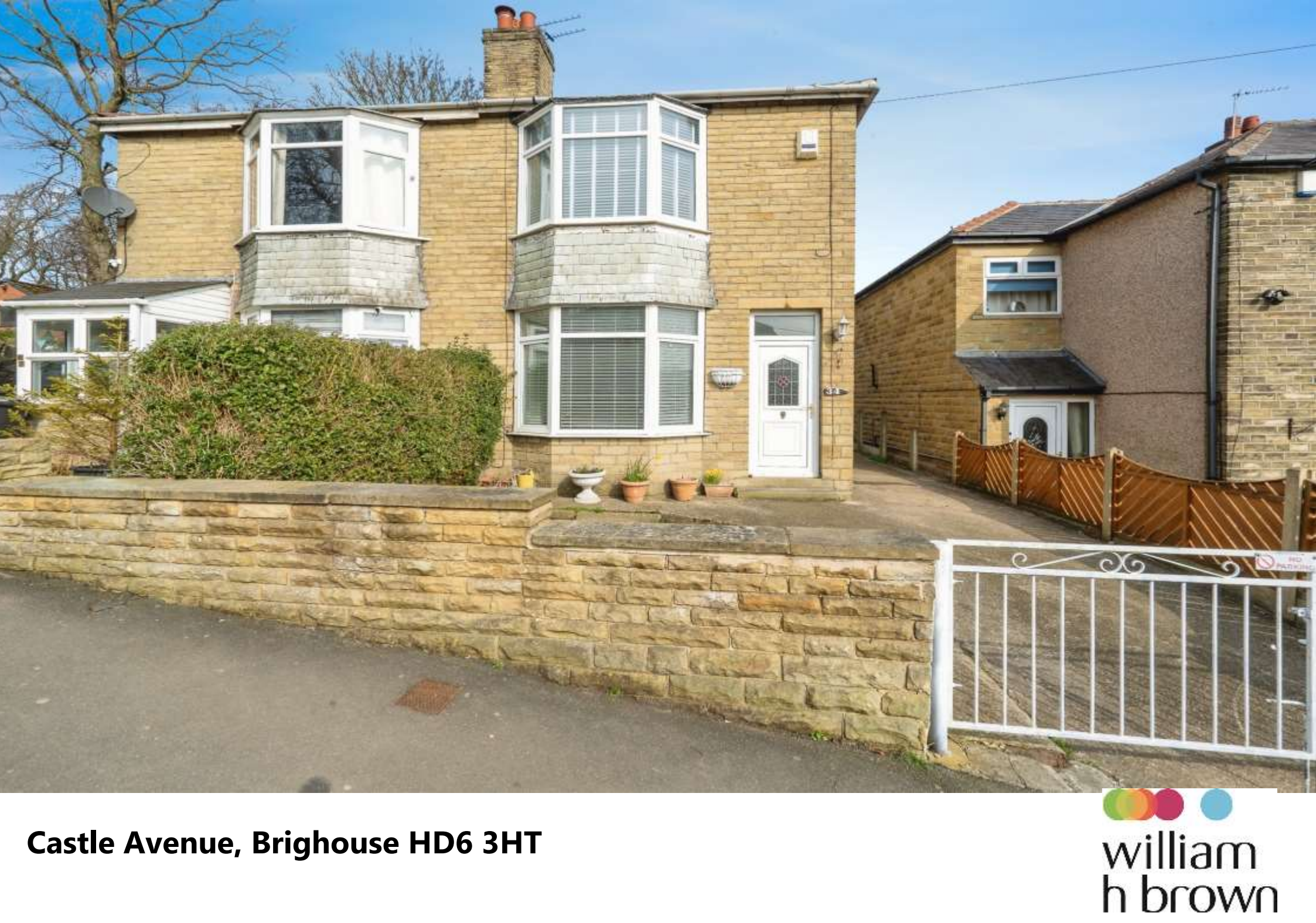
Castle Avenue, Brighouse HD6 3HT