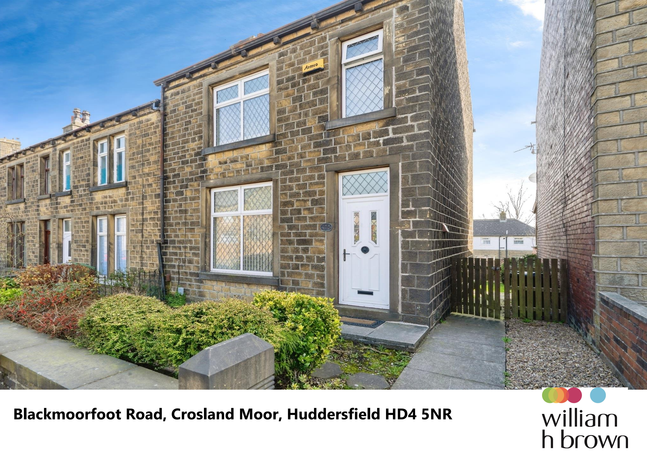
Blackmoorfoot Road, Crosland Moor, Huddersfield HD4 5NR