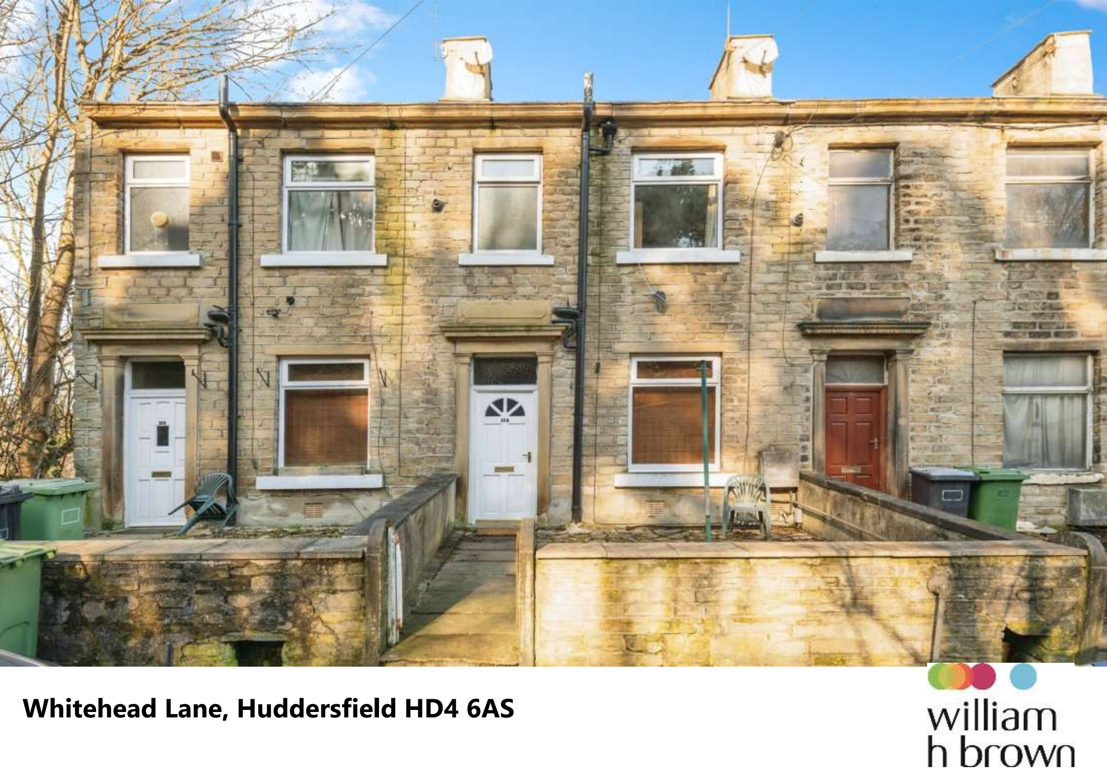
Whitehead Lane, Huddersfield HD4 6AS