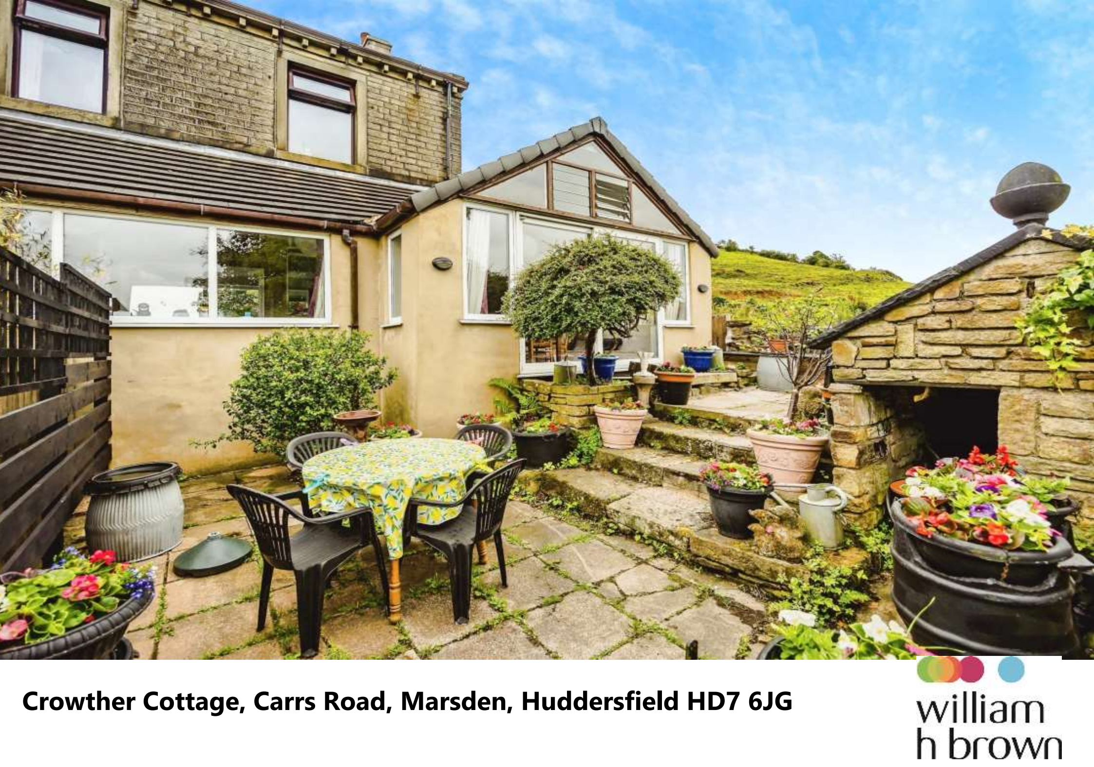
Crowther Cottage, Carrs Road, Marsden, Huddersfield HD7 6JG