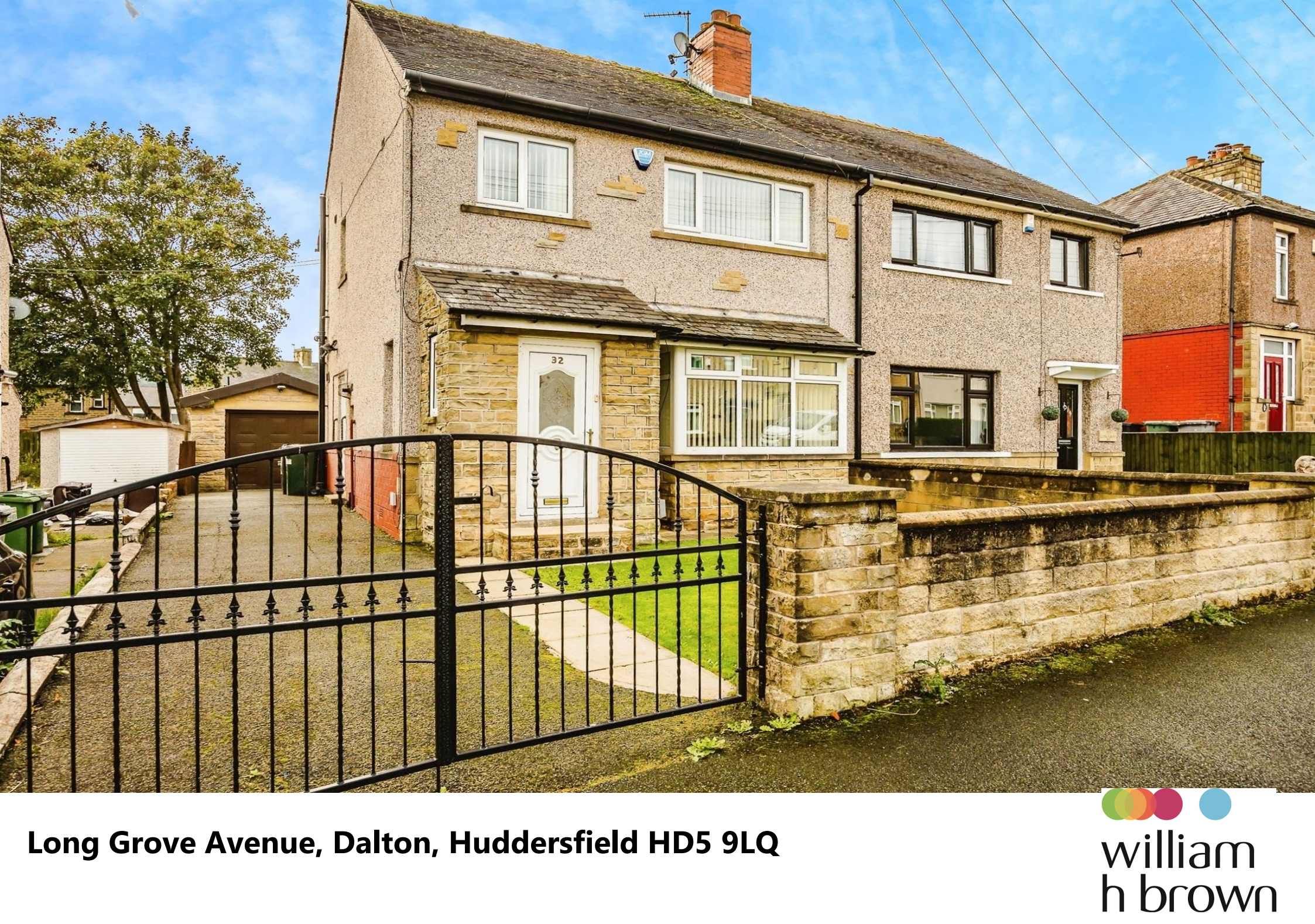
Long Grove Avenue, Dalton, Huddersfield HD5 9LQ