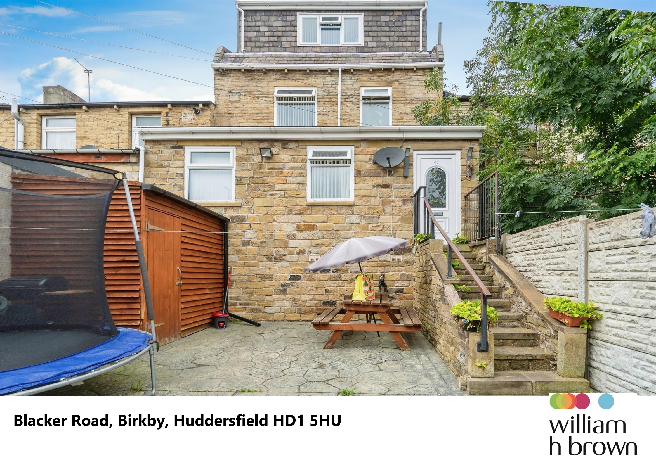
Blacker Road, Birkby, Huddersfield HD1 5HU