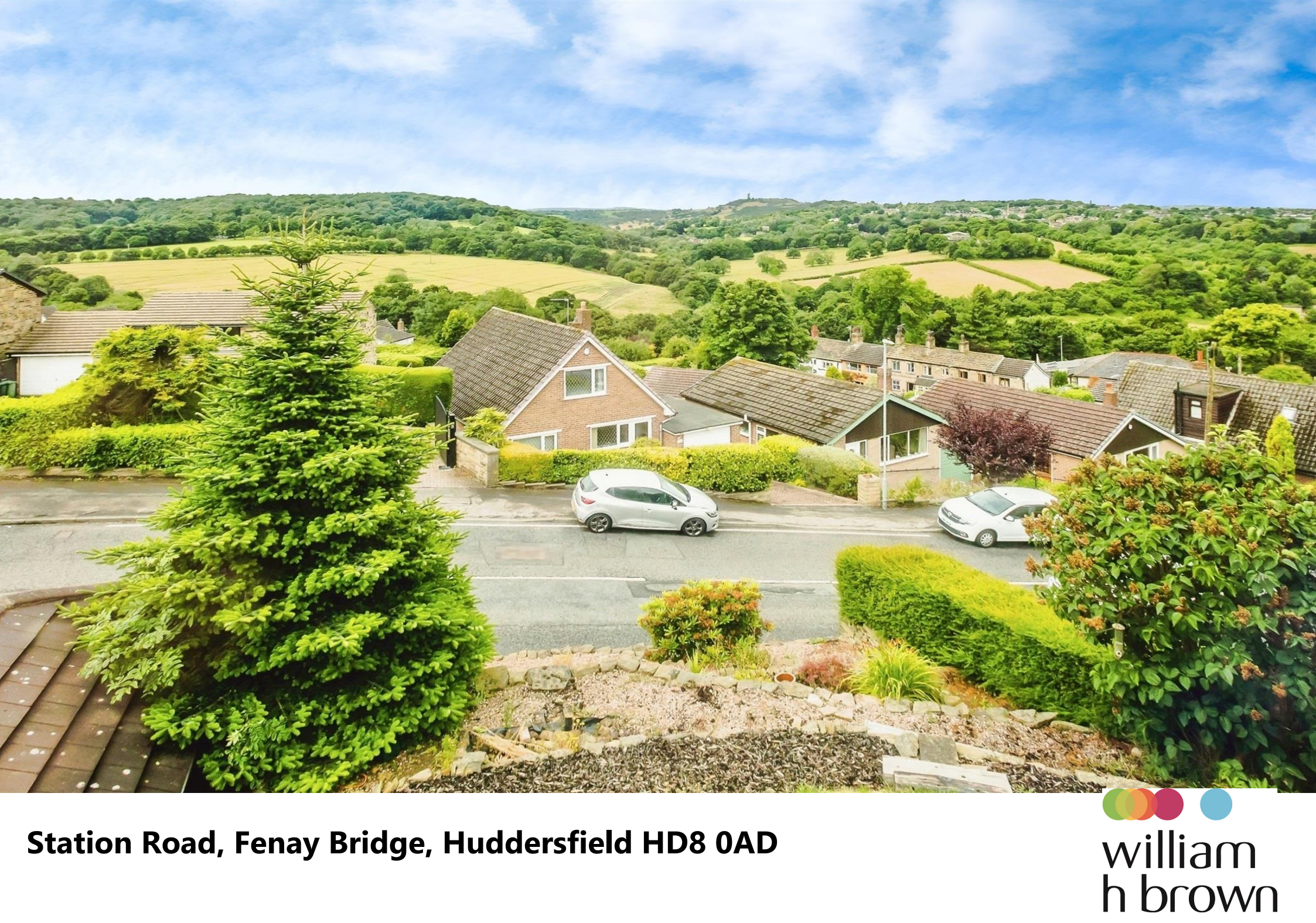
Station Road, Fenay Bridge, Huddersfield HD8 0AD