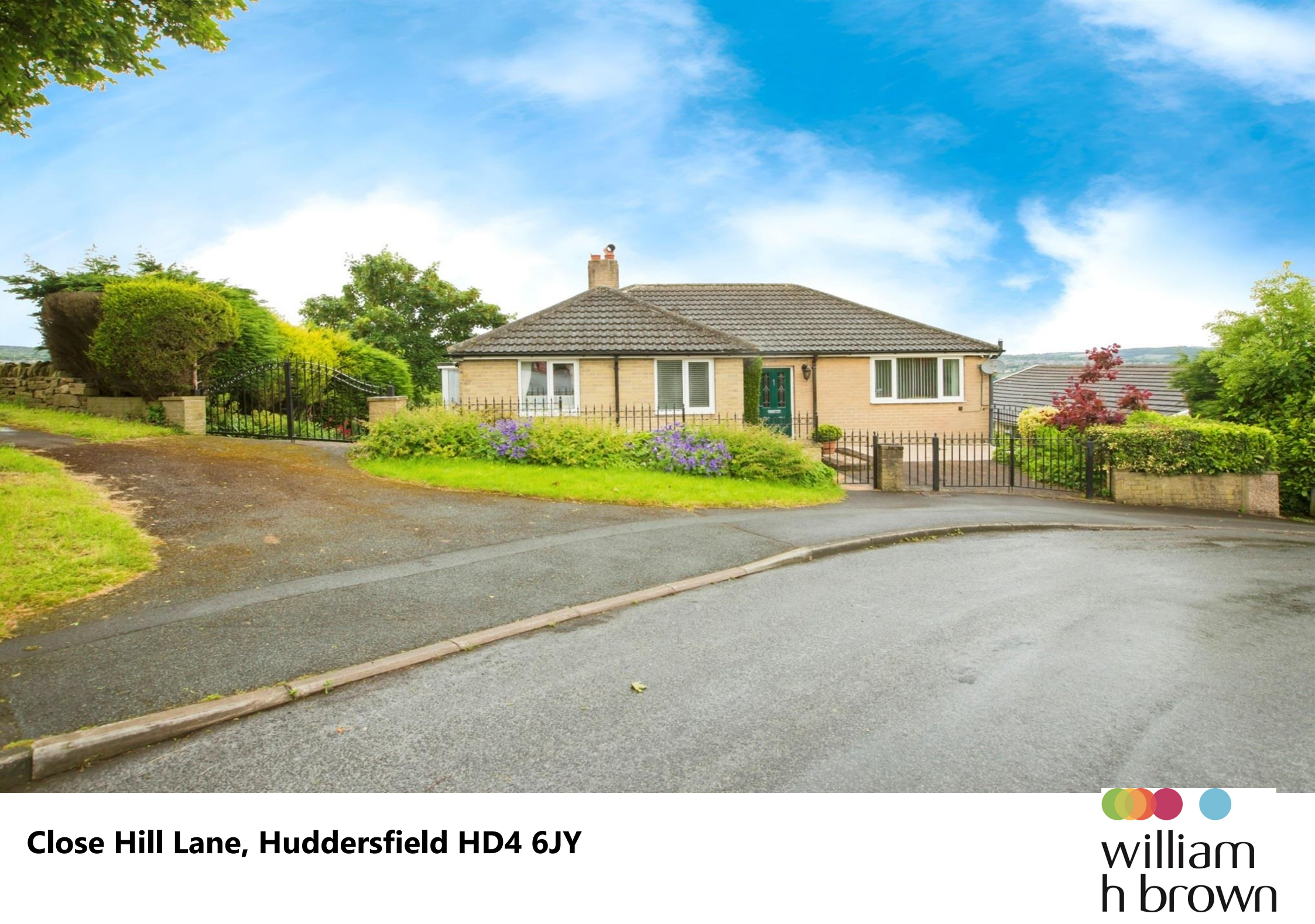
Close Hill Lane, Huddersfield HD4 6JY