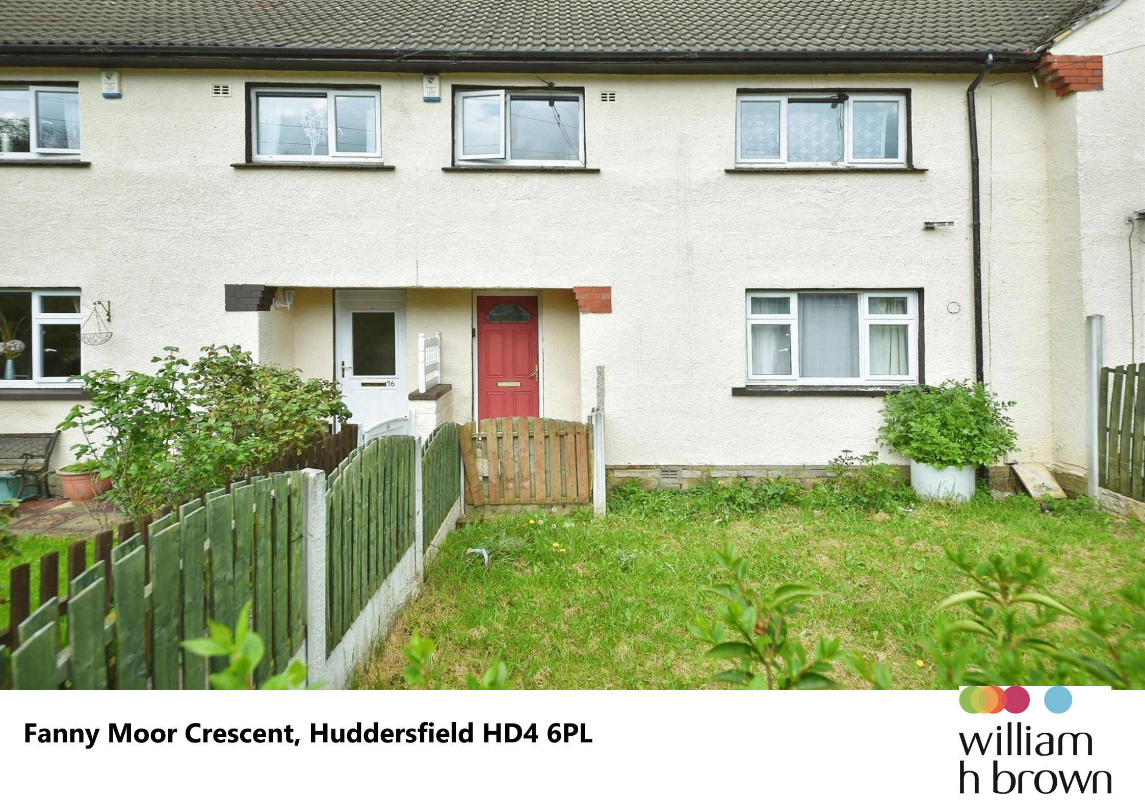
Fanny Moor Crescent, Huddersfield HD4 6PL