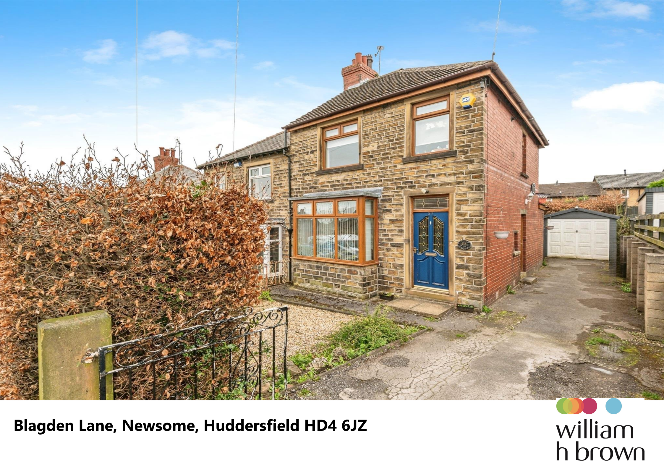
Blagden Lane, Newsome, Huddersfield HD4 6JZ