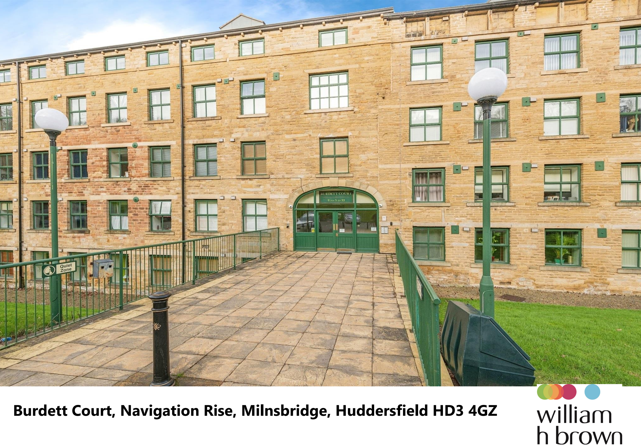
Burdett Court, Navigation Rise, Milnsbridge, Huddersfield HD3 4GZ