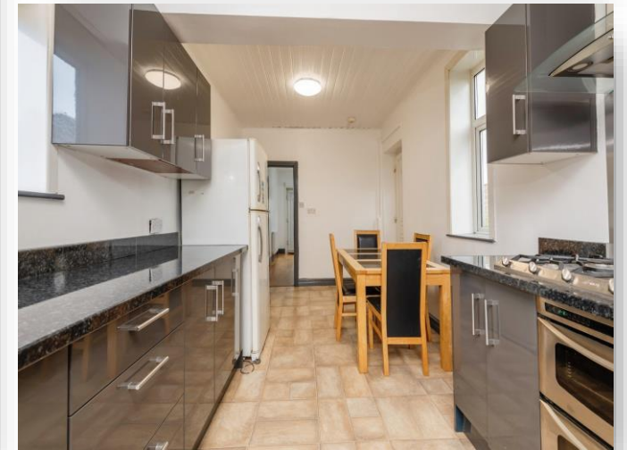
Mountjoy Road, Edgerton, Huddersfield HD1 5QG