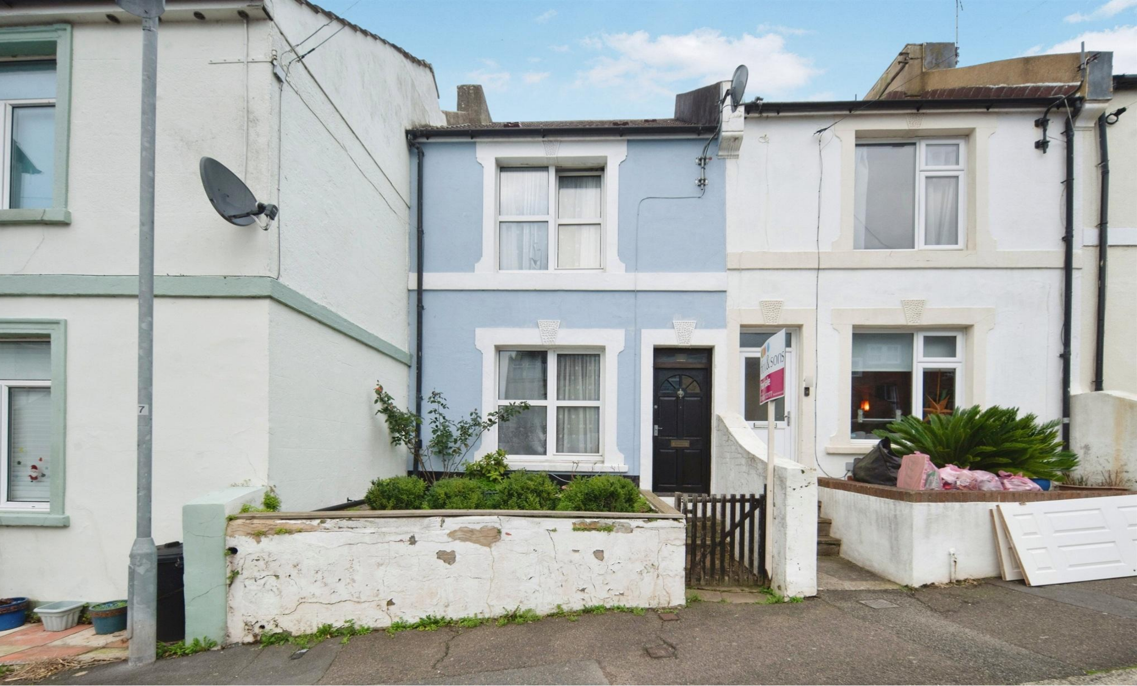
Cornfield Terrace, St. Leonards-On-Sea TN37 6JD