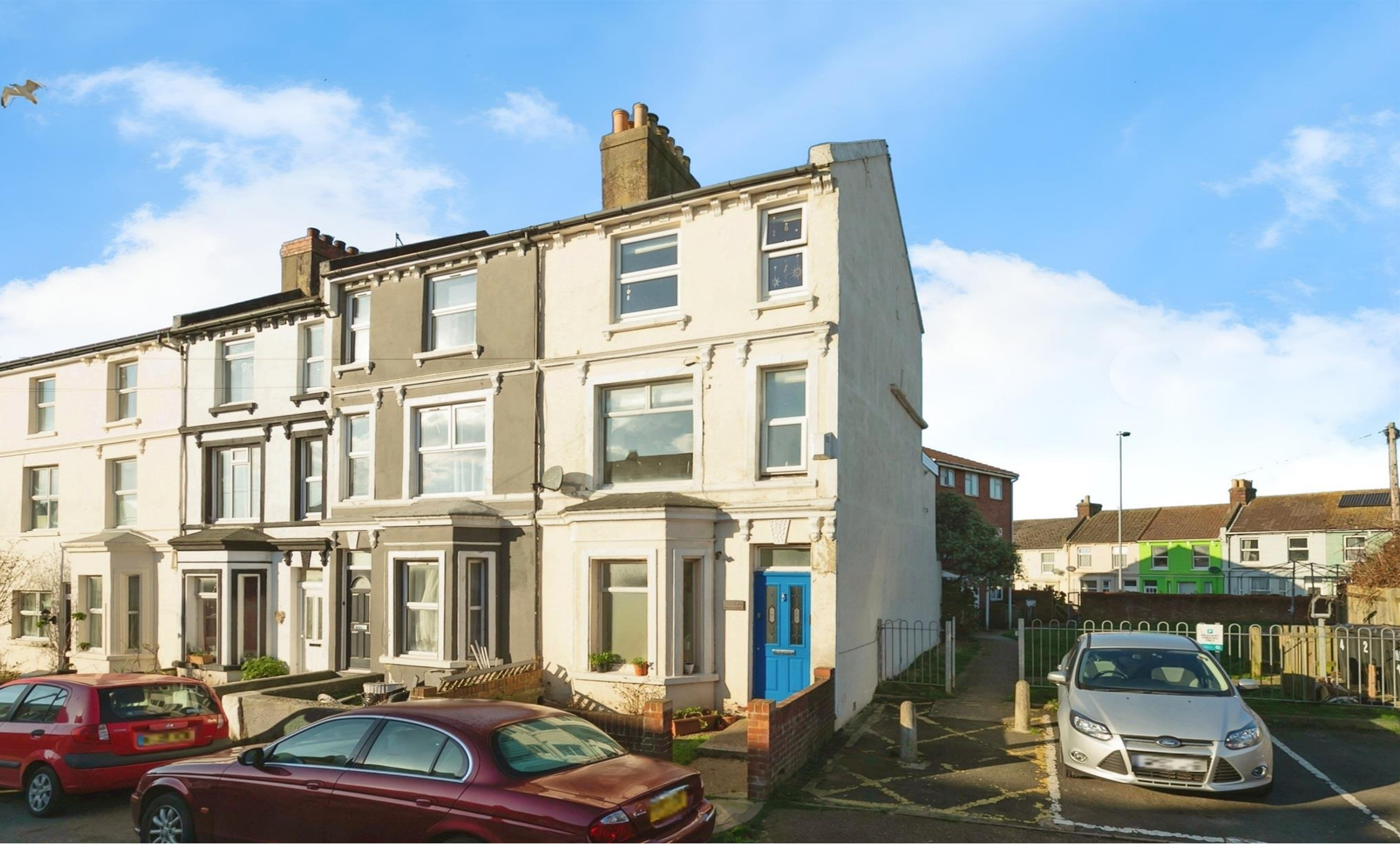
North Terrace, Hastings TN34 3NR