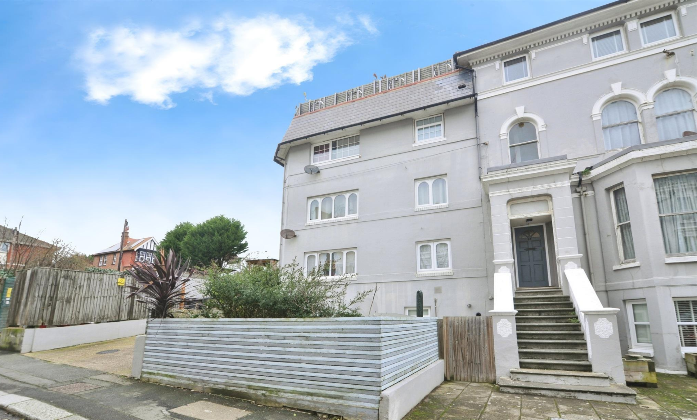
Monte Verde Court West Hill Road, St. Leonards-On-Sea TN38 0NB