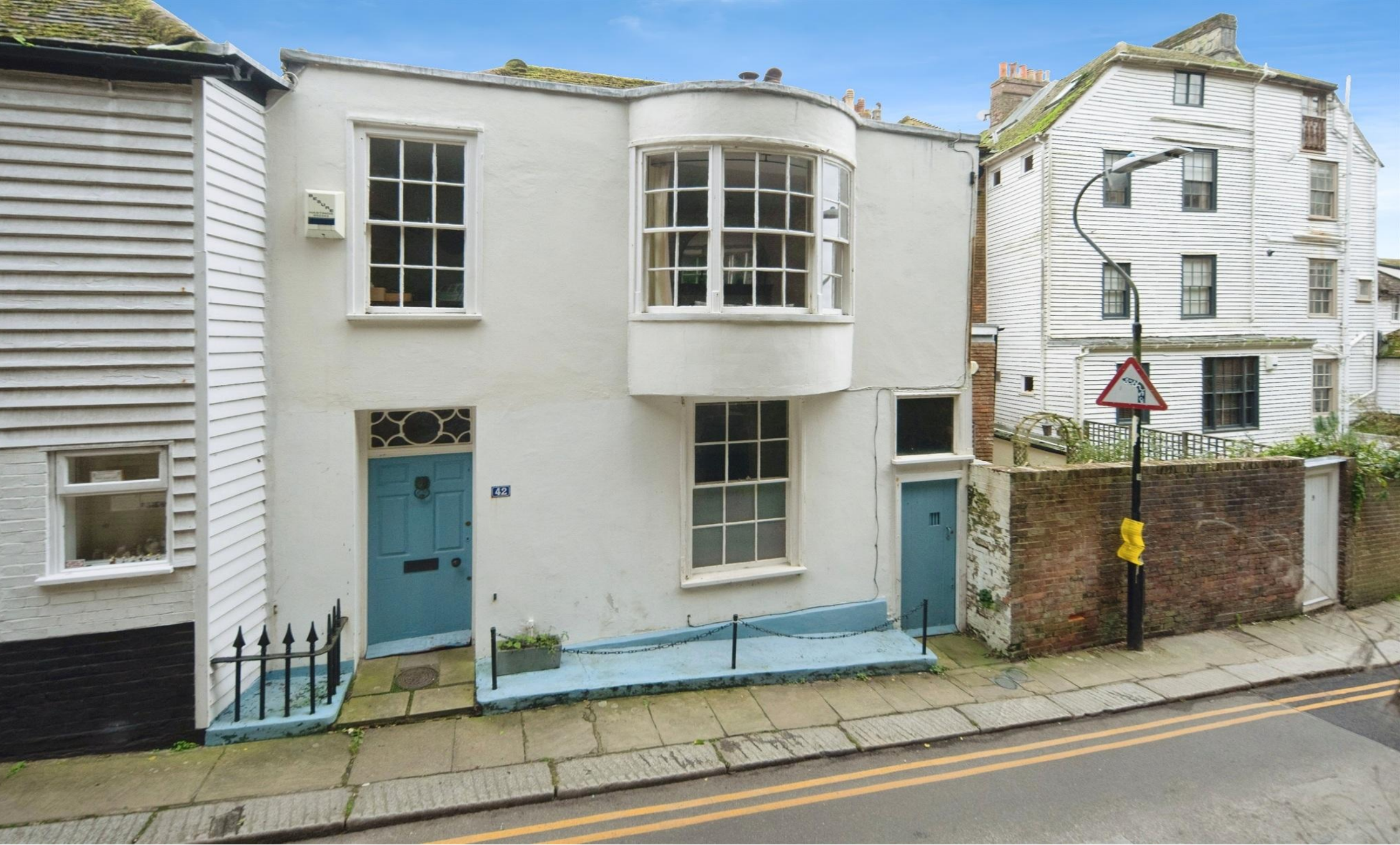
Croft Road, Hastings TN34 3HE