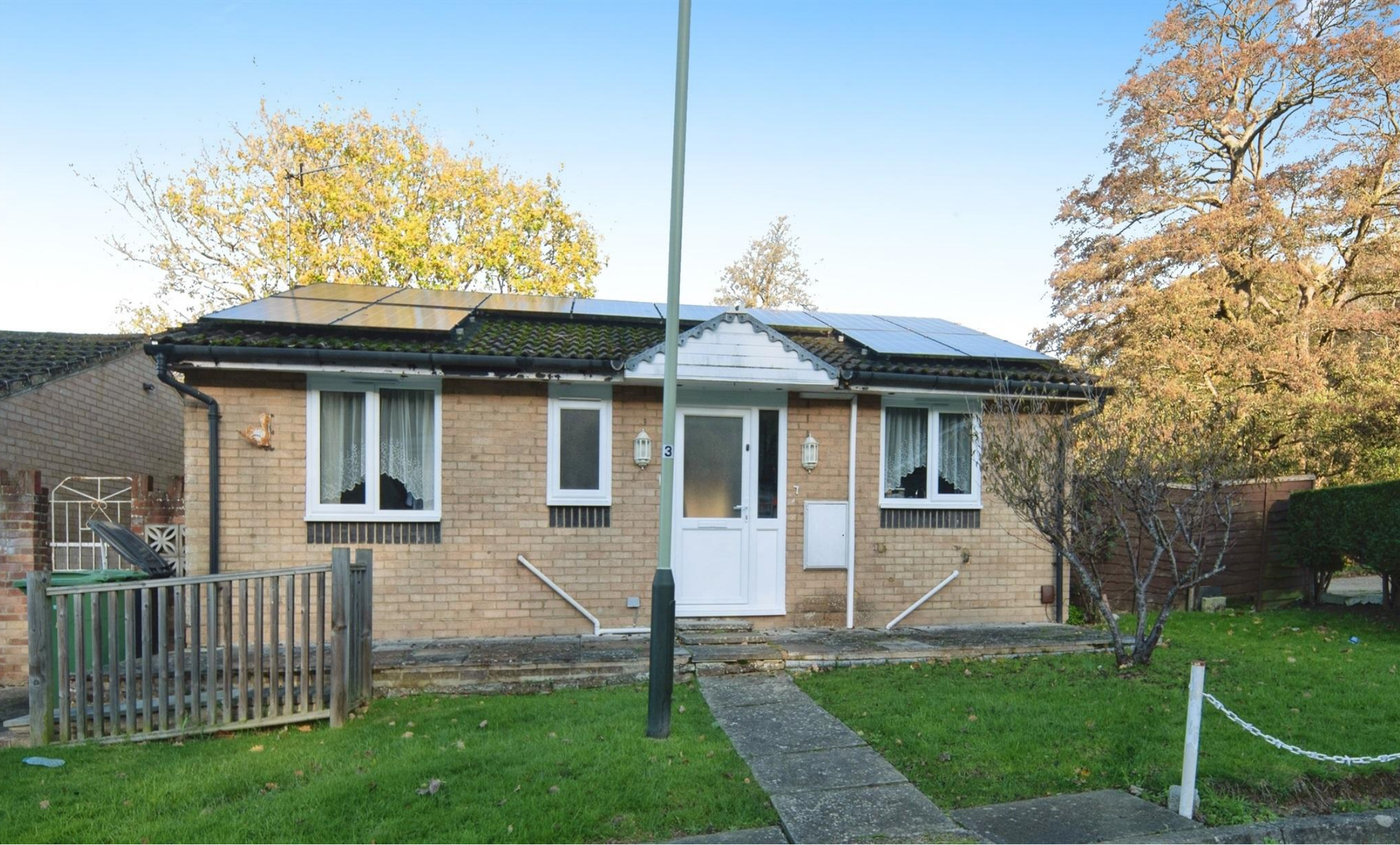
Arbourvale, St. Leonards-On-Sea TN38 0XY