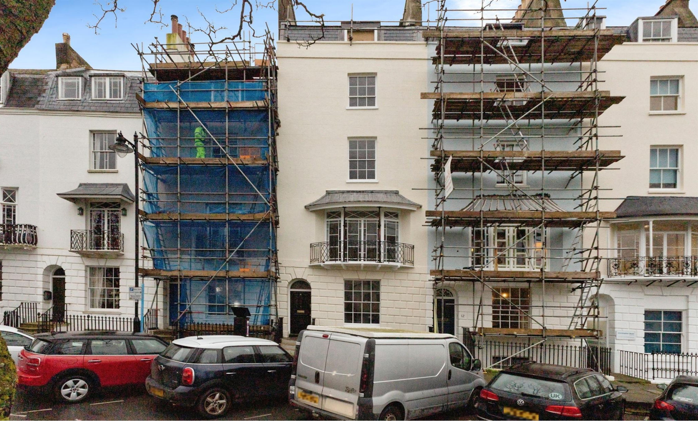
Wellington Square, Hastings TN34 1PB