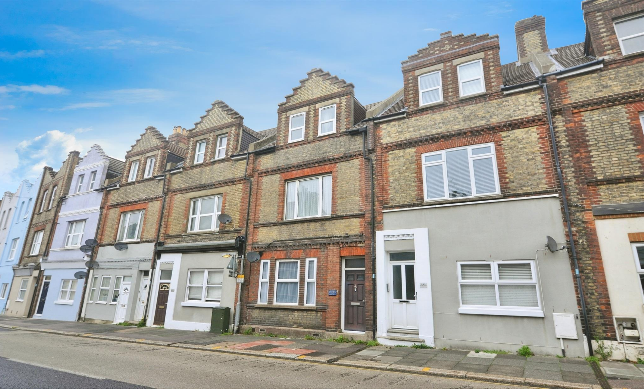
Ground Floor Flat Bohemia Road,ST. LEONARDS-ON-SEA TN37 6RL