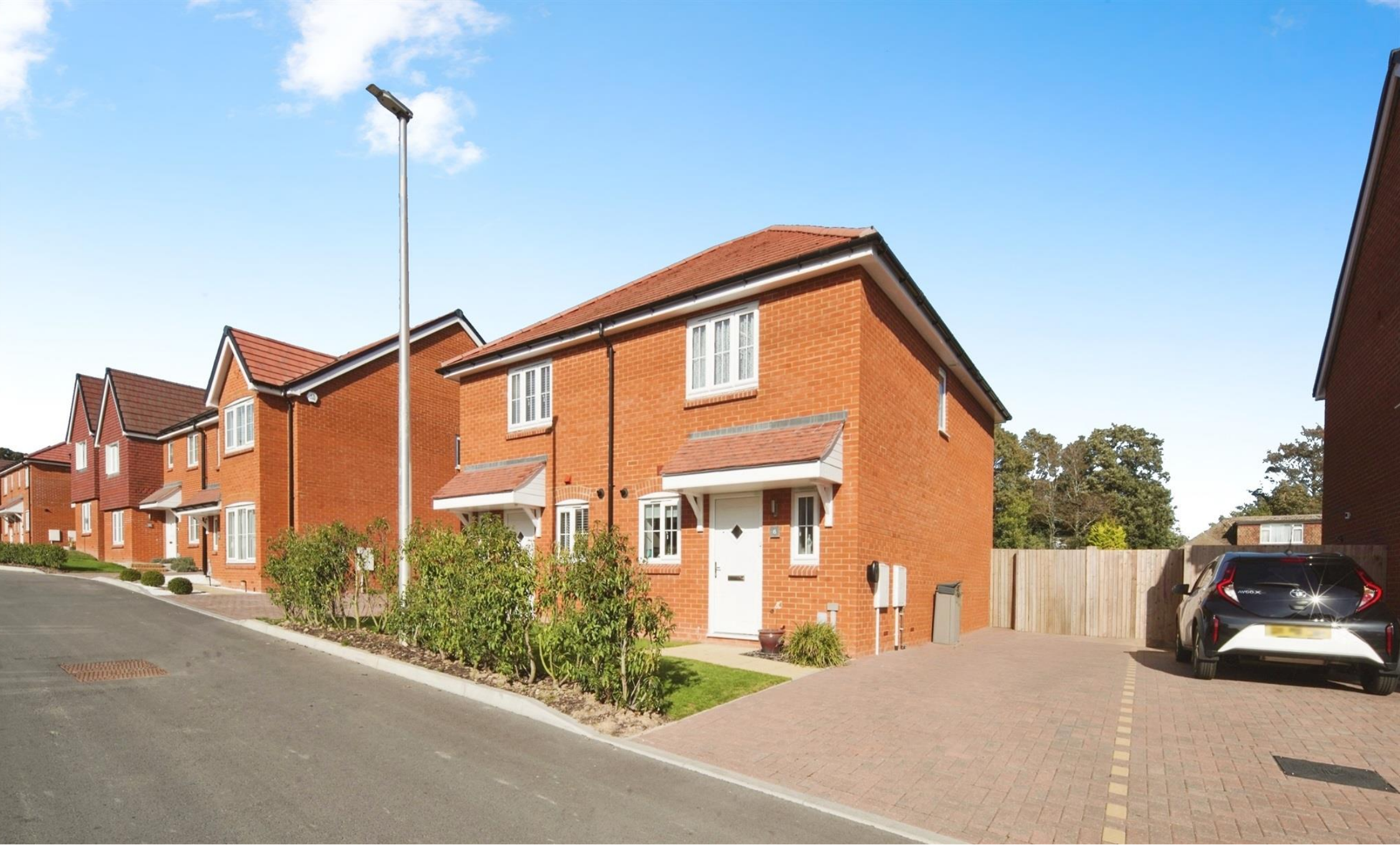
Levett Gardens, St. Leonards-On-Sea TN38 9TY