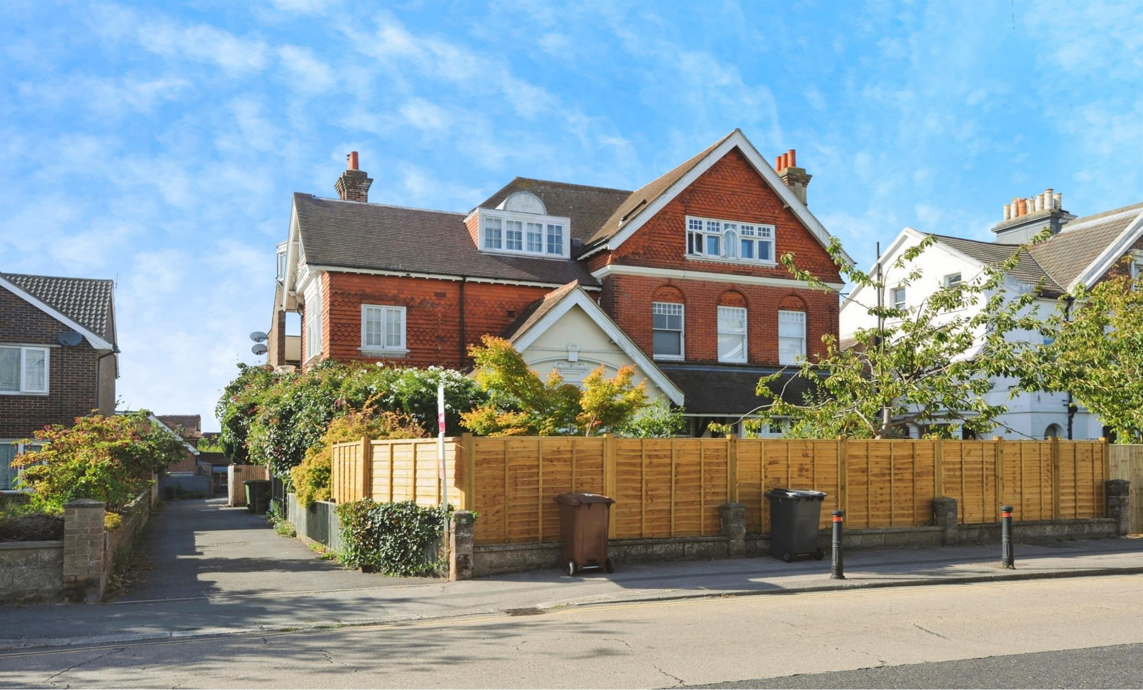
Fairseat Court Sedlescombe Road South, St. Leonards-On-Sea TN38 0TB