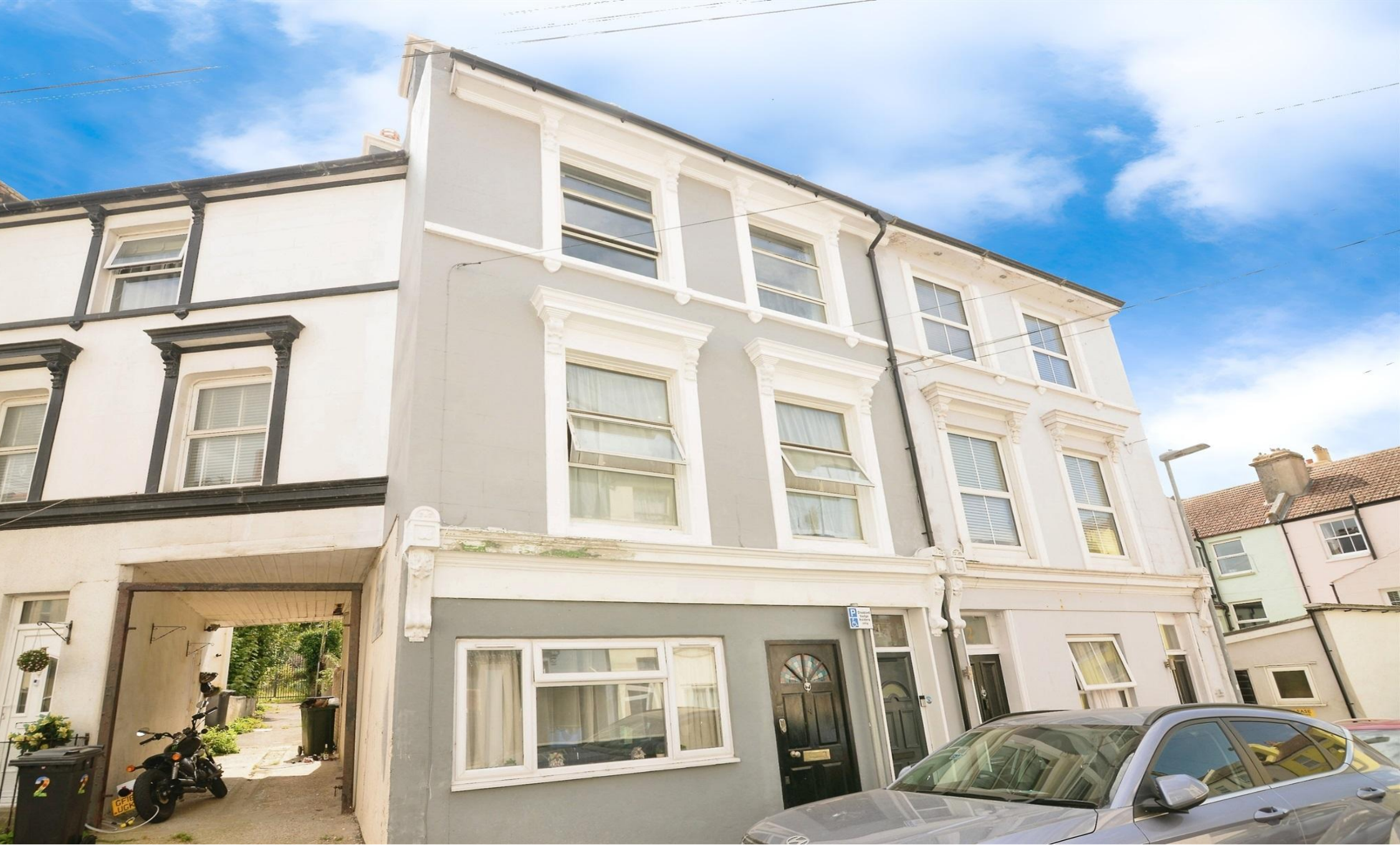
Hughenden Road, Hastings TN34 3TG