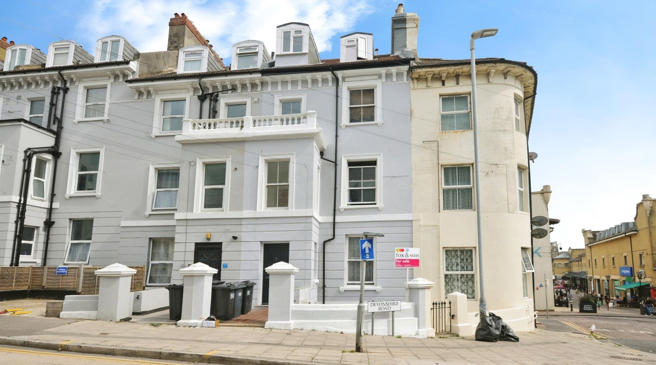
Flat 1 Devonshire Road, Hastings TN34 1NE