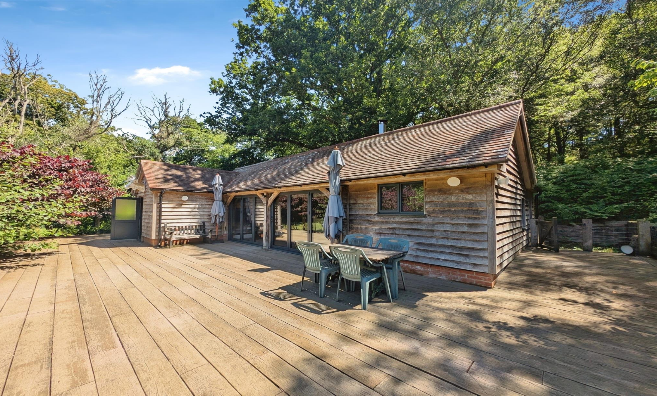
The Hammonds Telham Lane, Battle TN33 0SR