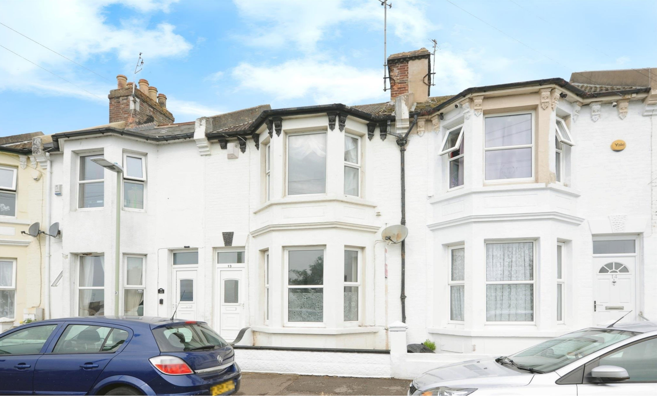
Halton Terrace, Hastings TN34 3NY